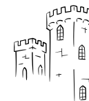
THE CASTLE at EDGEHILL